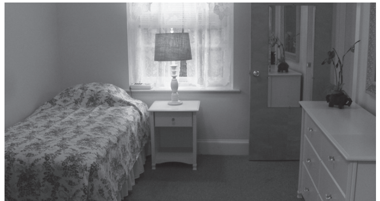
One example of grant funding benefitting residents: A Respite Room was redecorated with furnishings provided by a grant from The Mushroom Festival. Many of the Home's current residents first came to us for short-term respite stays.

$4,000 from the Hoxie Harrison Smith Foundation for fire safety system upgrades