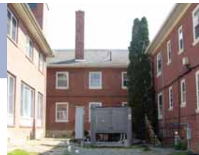
The courtyard as viewed from Linden Street.

At this printing, donations totaling $685 have been received toward the project's $1,400 goal. To learn more about how you can help, please call Helene at (610) 444-8785.