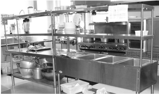
The new hot food preparation area and steam table.

As mentioned in previous issues of View from the Porch , Friends Home in Kennett's kitchen was in need of updating. A master plan that was developed in early 2008 included a modest expansion of the Home's main floor and a new kitchen. With the master plan in place, a feasibility study for a capital campaign was completed. Unfortunately, these events coincided with a nation-wide economic struggle, which caused us to delay fund raising. Even though funds were not specifically solicited, many individuals came forward with contributions toward the project.