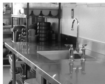
New storage racks, sink and preparation area.

The challenge was how to feed 70 people without a kitchen.