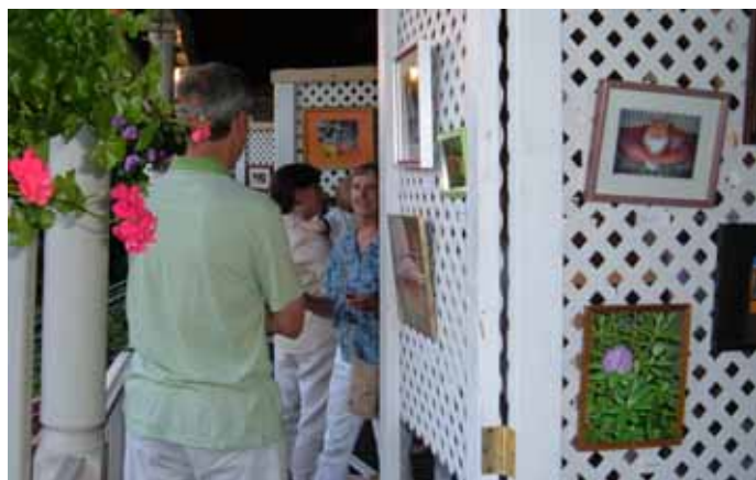
An estimated 300 guests viewed the 75 resident photographs on the Friends Home porch